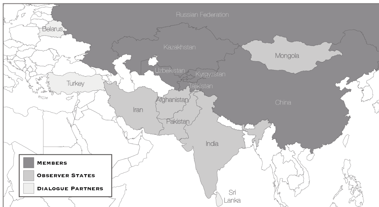
Map of SCO area

Beginning with the talks to resolve tensions over border demarcation in the early 1990s, the SCO’s security agenda has been expanded to focus mainly on transnational issues, which could not be effectively addressed by one member’s efforts alone. Initially, this entailed a concentration on